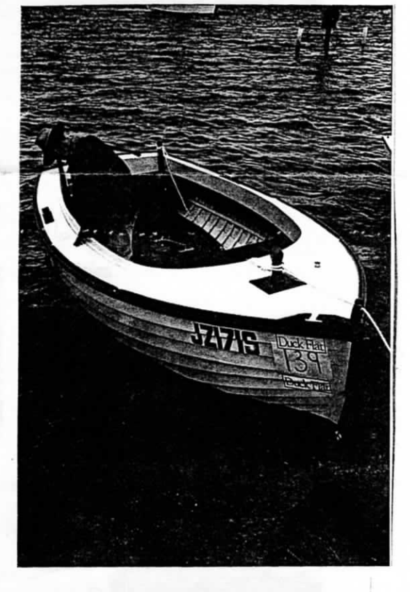
An interesting origial putt-putt, one of several, this one Chapman Pup powered.