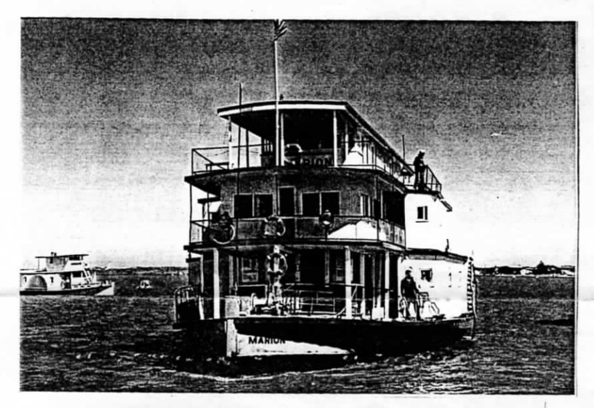
A grand old lady. 100 yr-old PS "Marion".

Your editor was fortunate enough to be able to attend the Wooden Boat Festival held bi-annually at Goolwa at the mouth of the Murray River in South Australia. This year's event was held in glorious March weather with boats attending from as far afield as Queensland and Western Australia. If one picture is worth a thousand words, then here's a few thousand for you to be getting along with.