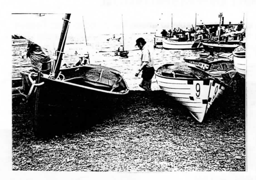
A Joel White "Catspaw" (L) and an Oughtred "Acorn 12" between activities.