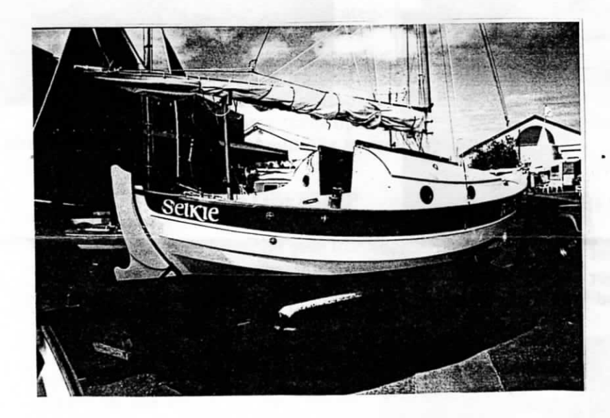
An immaculate "Grey Seal" sloop, also by Ian Oughtred.