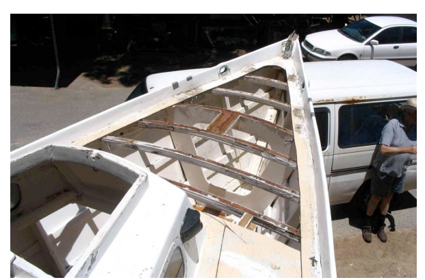
Minx's foredeck has been removed

dinette (caravan style) and a V berth forward, she could accommodate up to five overnight. The Dogger design is a well proven ocean going vessel. There are at least 5 Doggers on the river. One of these, Onawind from Royal Freshwater Bay Yacht Club was a very active ocean racer in the 1970's. She can still be seen moored in Blackwall Reach.