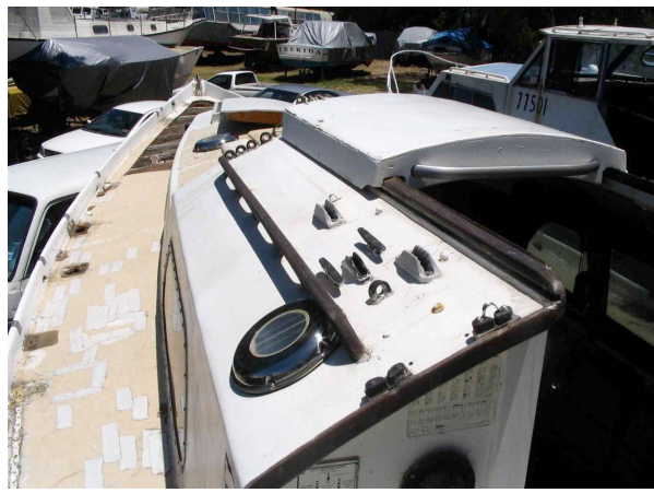
Along the coach house. Got enough cleats?

They are currently focussed on removing the deck ply which had reached the end of its life. This has produced some difficulties around the gunwale area where they are contemplating several conflicting pieces of advice. Currently they are leaving two inches of the deck in place with the intention of building up the deck beams to the old deck thickness and placing the new deck over the top of the residual old deck around the gunwale line.