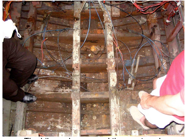
The bilges always need the most work

The layout consisted of a small cockpit at the stern with a ladder to the upper deck and fly bridge helm position. A companion way from the cockpit led to the aft cabin which was set low in the hull. This contained a bunk each side. Further forward the floor was raised to a central dinette and the internal helm position (one could call this the bridge).