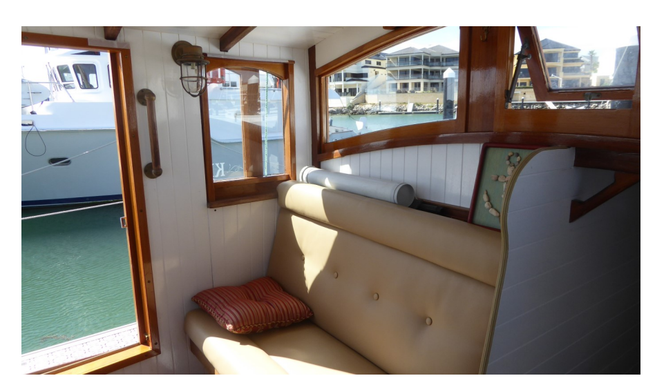
RON AND DORA CAN ENJOY A COMFORTABLE RIDE ON THE 3 HOUR CROSSING TO ROTTNEST