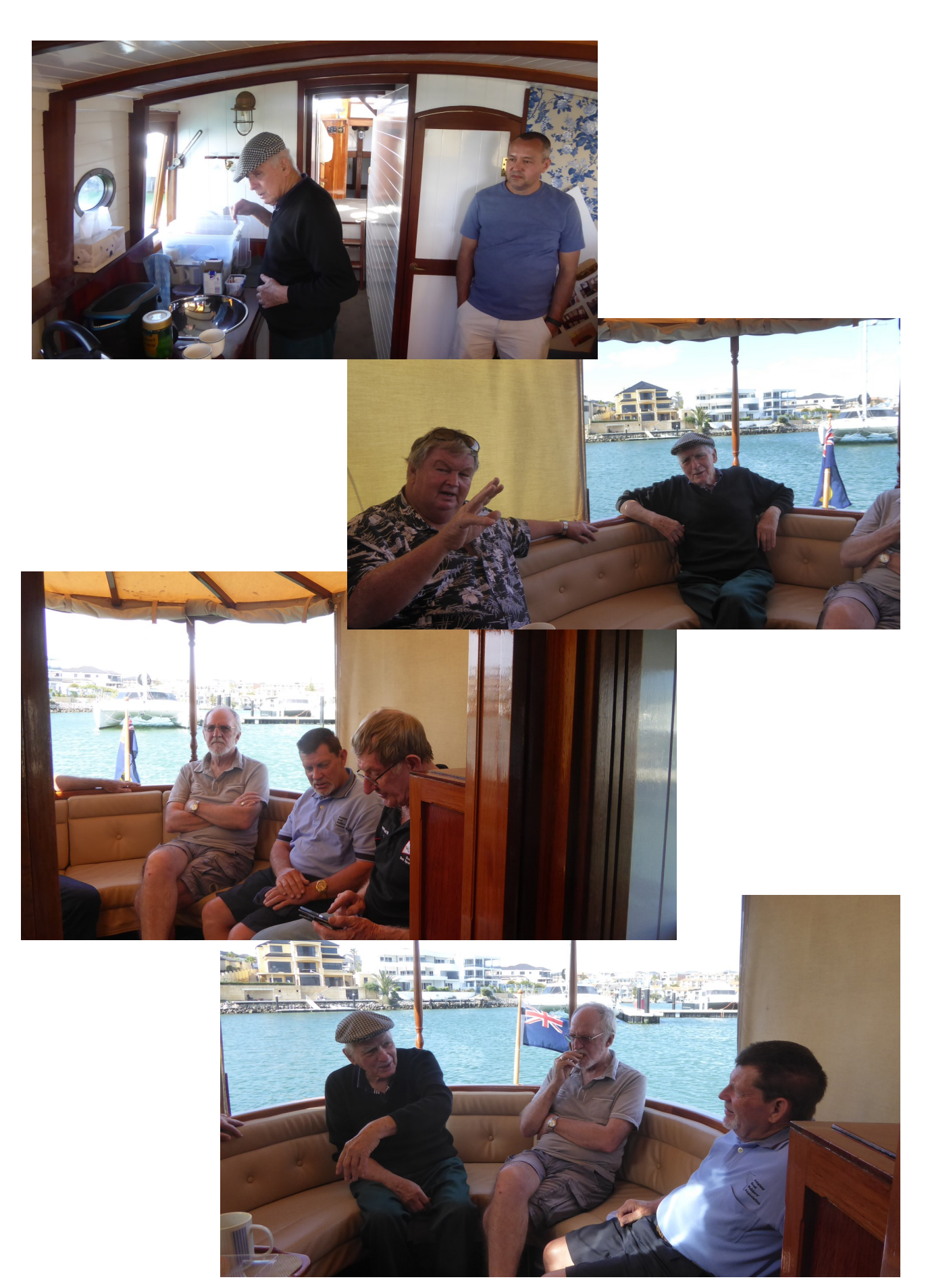
RELAXING IN THE "BEER GARDEN" AS IT'S CALLED