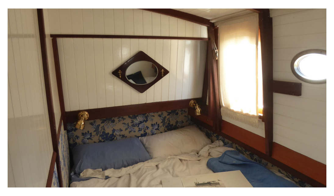
NO CRAMPED V-BERTHS OR QUARTER BERTHS BUT A FULL SIZE DOUBLE BED