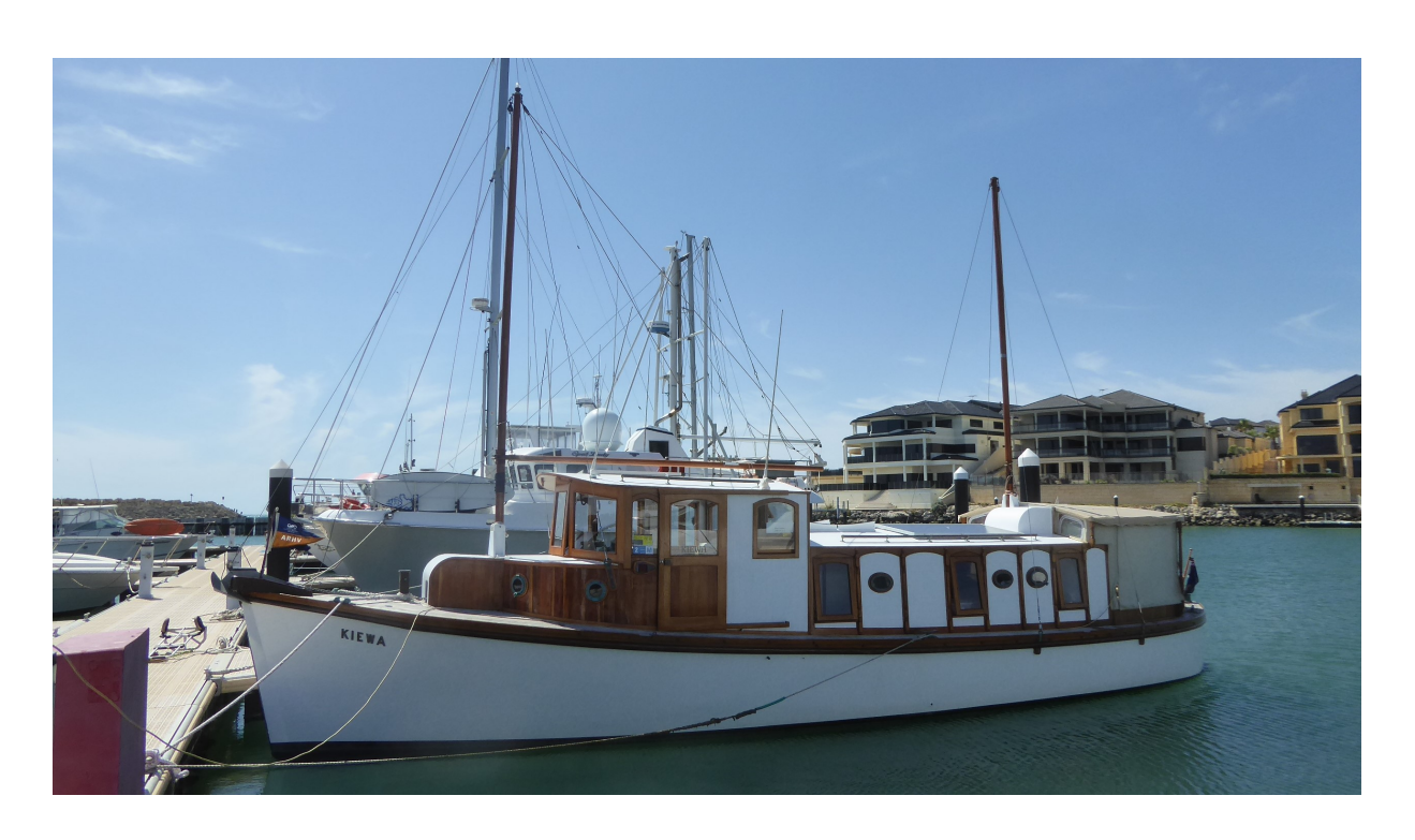
KEIWA AT HOME IN HER PEN AT MINDARIE KEYS MARINA