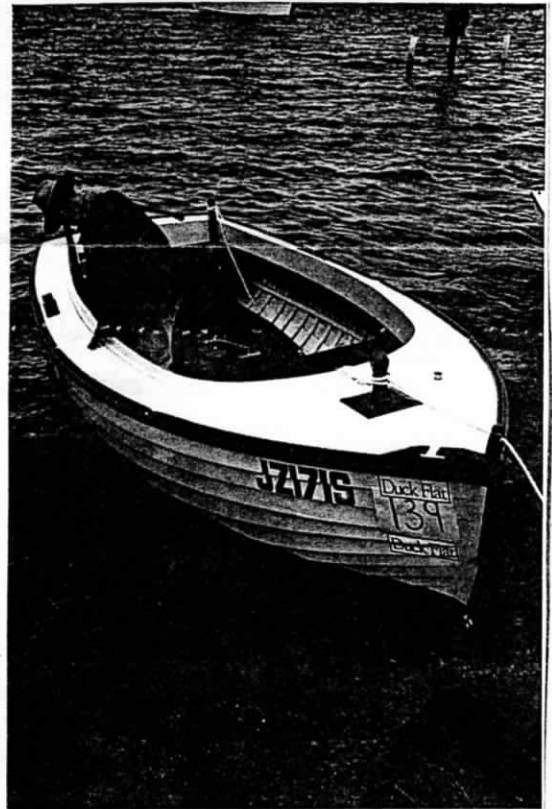
An interesting original putt-putt, one of several, this one Chapman Pup powered.