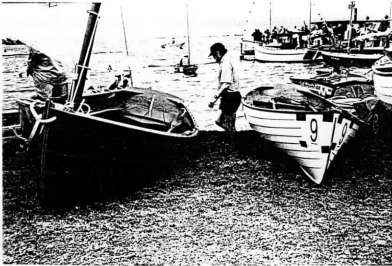
A Joel White "Catspaw" (L) and an Oughtred "Acorn 12" between activities.