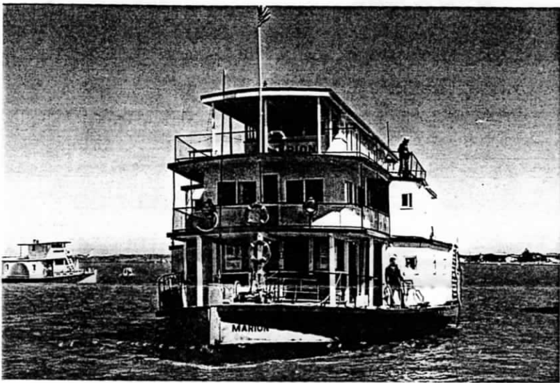
A grand old lady. 100 yr-old PS "Marion".

Your editor was fortunate enough to be able to attend the Wooden Boat Festival held bi-annually at Goolwa at the mouth of the Murray River in South Australia. This year's event was held in glorious March weather with boats attending from as far afield as Queensland and Western Australia. If one picture is worth a thousand words, then here's a few thousand for you to be getting along with.