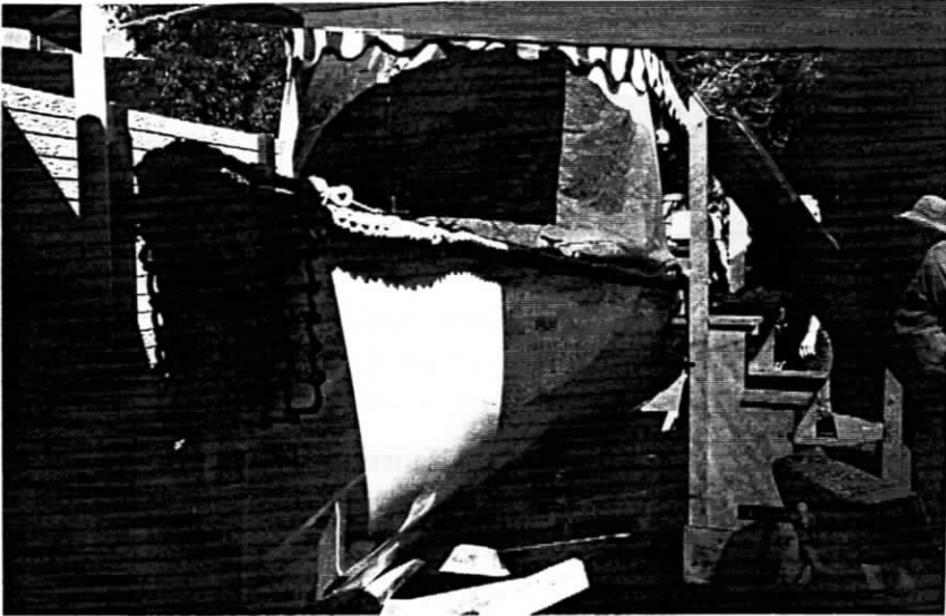
The bow fender, woven by Alan, rather more elaborate than most, but who wants to scratch this delightful boat?